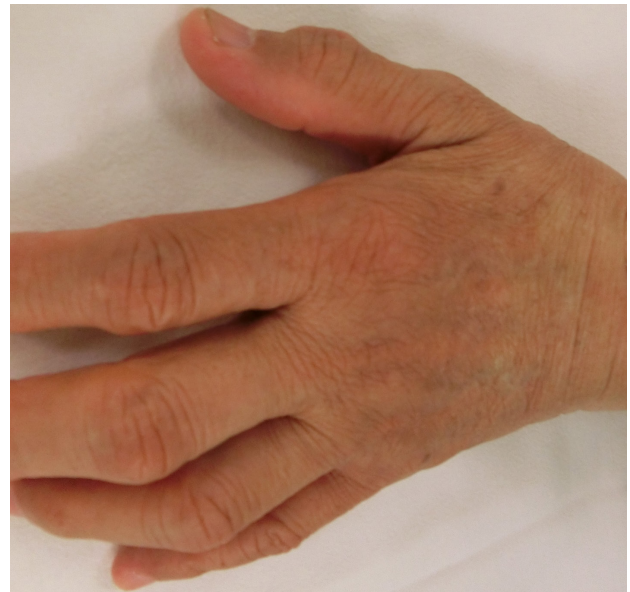
Figure 1: Ulnar clawing was noted at the left hand, preoperatively

A 51-year-old Chinese man presented to our outpatient clinic with tingling and numbness at the ulnar two digits of the left hand for around one year. On examination, there was clawing at the ulnar two digits (Figure 1) of the left hand, hypothenar muscles were wasted, and sensation was markedly reduced over the area. Card test and Froment's sign were found positive, Tinel's sign and compression of the nerve at the cubital tunnel were also found positive. Clinically, he was diagnosed as a case of severe CuTS and was advised for the USG of the ulnar nerve around the elbow and electrodiagnostic study. Nerve conduction study (NCS) of the left upper limb revealed that the sensory and motor conduction of the left ulnar nerve was not elicitable and there was marked axonal damage of the left ulnar nerve. USG findings showed a mass, along the ulnar nerve, at about three centimetres proximal to the medial epicondyle of the left elbow. The mass was cystic in nature with increased vascularity and displaced the nerve fibres laterally. The radiologist commented that the mass was highly suggestive of Schwannoma (Figure 2).