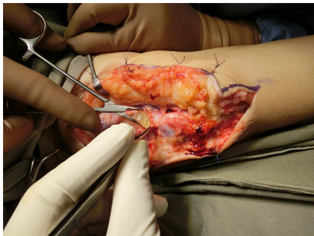
Figure 3: Incision was made on the epineurium of the ulnar nerve over the swelling; gelatinous material was found inside