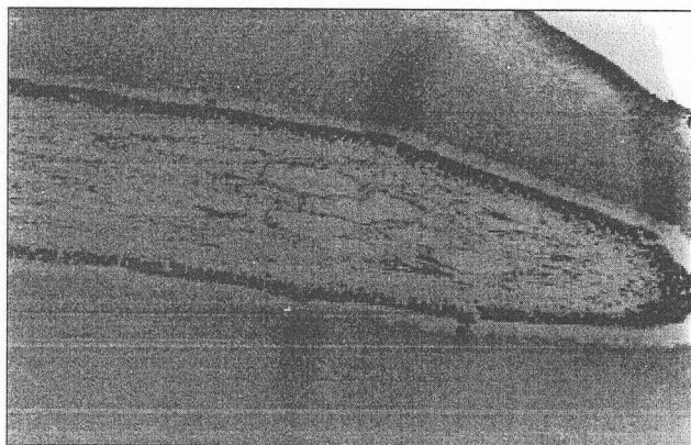
Fig. 3 Histological appearance of the ferret dental pulp. H & E stain - Original magnification x 40.

human dental pulp is the regular occurrence of vessel dilatation in the ferret which suggest that the tooth has been subjected to some sort of trauma. This is probably due to the ferret using the canines to gnaw the bars of the cage resulting in vascular changes of the pulp. However, others (26) have concluded from their study that excessive occlusal force over a short period of time (0-7 months), did not cause pulpal changes in the tooth of the rat and it is possible, therefore, that vessel dilatation may be a normal morphological feature in the pulp of the ferret. Further experiments conducted by Landay, as cited by Al-Rubayi (18), indicated that heavy forces applied to the rat molar by cementing a metal post into the molar tooth, had brought degeneration and inflammatory changes in the pulp of the opposing molar after 7 months. The odontoblasts underwent atrophic changes and scattered chronic inflammatory changes began to appear in the pulp. This would add weight to the suggestion that the vascular dilatation seen in the ferret is the result of gnawing action.