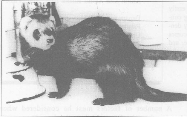
Fig.1 Ferret animal.

The ferret has been investigated as an experimental animal for dental research (17,18,19). It has been used for periodontal research (20), alveolar bone metabolism (21) and for caries research (17). The pulpal response to dental materials has been widely investigated using the