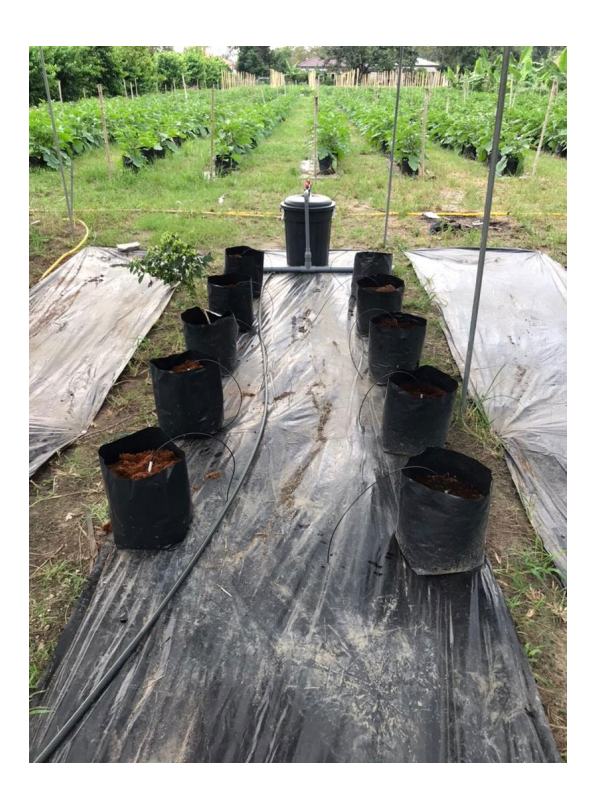
Figure 3: A fertigation system

Other than applying engineering knowledge, he managed to design the composition of fertilization as described below. For this purpose, he includes science knowledge .