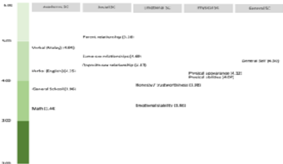
Figure 2. Itemised profile of self-concepts of SSeM Students (N=232)

An itemised profile (Figure 2) of the self-concept of the art school students revealed that all the sub-categories scored within the range of “slightly-high” (4.00-5.99) with some minor exceptions. Students’ social self-concepts were notably on the high side: parent relationships ranked top as the single “high “item, and relationships with the same-sex and the opposite-sex were good. The art school students saw themselves as effective, capable and contented with the way they were (General Self, 4.50); and were satisfied with their physical appearances (4.12). SSeM students were confident with their language skills, especially with Malay (4.94). However, they seemed less confident in studying school subjects in general (General School, 3.96) and the issue of honesty (3.98). Educators may benefit from acknowledging that mathematics and emotional stability are the two most challenging items for the artistically-talented students.