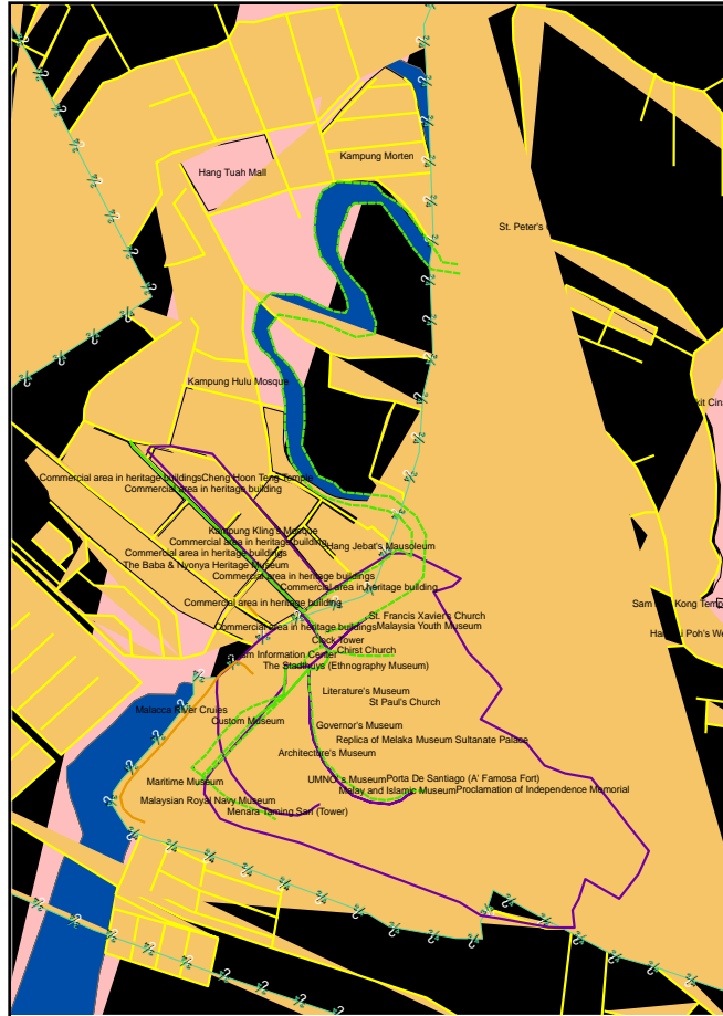
Figure 4: Types of Mobility in Melaka Historical City

Figure 4 confirms the results of participant observation. It shows spatially how accessible the types of mobility in the study area. Public bus routes and tour by car do not allow tourists to access their destinations easily. River cruise gives better experience. It allows tourists to experience all the four of urban sensory elements. However, it produces carbon footprint.