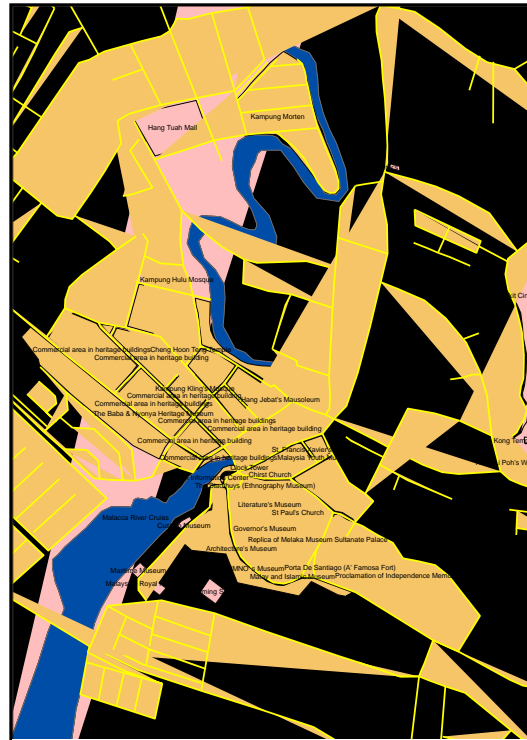
Figure 3: Distribution of Attractions in Melaka Historical City

Using GIS application, the distance between historical buildings and monuments can be measured easily. Furthermore, this application is able to show the areas that are accessible by car, trishaw and walking. The distance within the world heritage sites near St Paul's Hill is around one kilometer. Nevertheless, the areas along Jonker Street and Jalan Tukang Besi are within one kilometer too. Similarly in Kampung Morten, areas within this heritage site are within one kilometer.