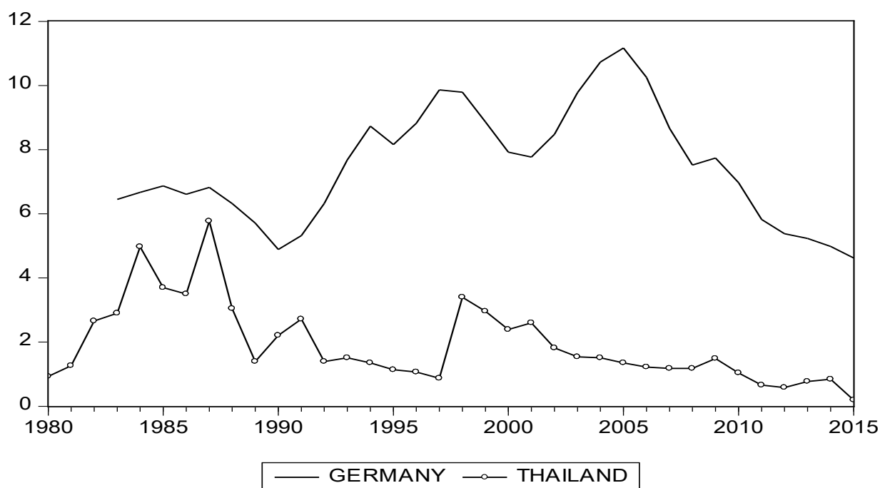
Figure 1: Unemployment rates in Germany and Thailand (1980-2015)

By contrast, unemployment in Asia is typically low. A distinctive feature of the Asian unemployment pattern is that unemployment rates are quite stable and do not appear to be affected by economic conditions (The Economist, 2018a). This contrasts with the situation in Europe, where unemployment rates are much more volatile and react sensitively to the ups and downs of the economy.