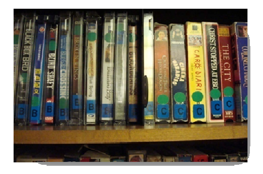
Figure 2: DVDs and VHS Media Organised on Shelves with Cover Spines Facing Outwards.

With a growing number of fields of studies, such as music, journalism, business, and telecommunications incorporating the use of videos in their teaching and research activities, it has become an important function for many academic libraries in North American universities to service video collections to their patrons. Along with similar services provided when it comes to print materials, videos such as DVDs and VHS tapes are also organised on shelves with their spines facing outwards as shown in Figure 2. Libraries do not distinguish between the way different kinds of media should be organised and patrons are expected to satisfy their information needs using similar strategies when interacting with either print or video materials.