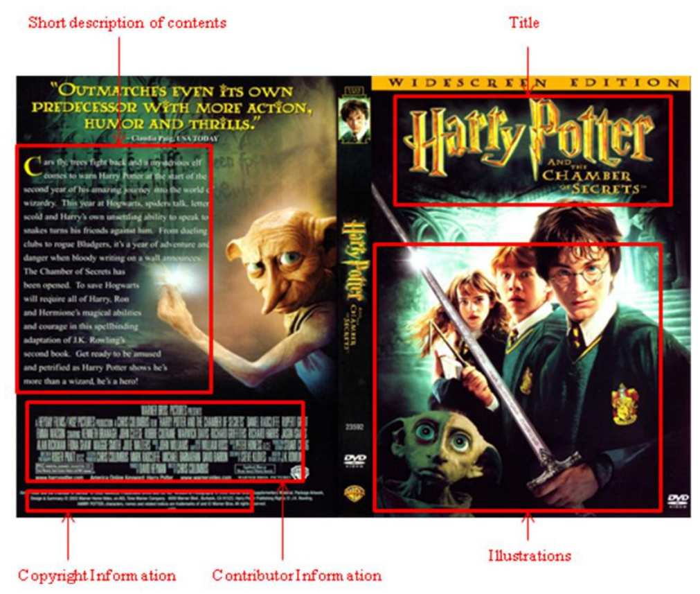
Figure 1: Types of Information Supplied on the Cover of a DVD Video.

Video collections, such as DVDs and VHS tapes, however, have characteristics that are different from text-based materials. Their full contents can only be viewed with additional technological support such as a DVD player and VHS tape player with a suitable monitor screen. To aid in identifying their contents without any technological support, the covers of DVD and VHS tapes are usually designed in such a way that they contain certain textual information and coloured illustrations that assist individuals in deciding whether the particular material may satisfy their information need. Oftentimes, the information that is included on the cover of a DVD/VHS includes a short description of the contents of the video, a relevant title, the name of the characters playing in the video, duration of the video, producer information, names of individuals or organisations that contributed to the video, technical information about the media, and any associated copyright information. This limited information provided on the DVD cover, in the absence of other information, such as reviews or recommendations usually remain the sole source of information that individuals can use to make a decision whether the video may be useful or not for their information need. Figure 1 shows a typical example of the kinds of information provided on the cover of the famous "Harry Potter" DVD video.